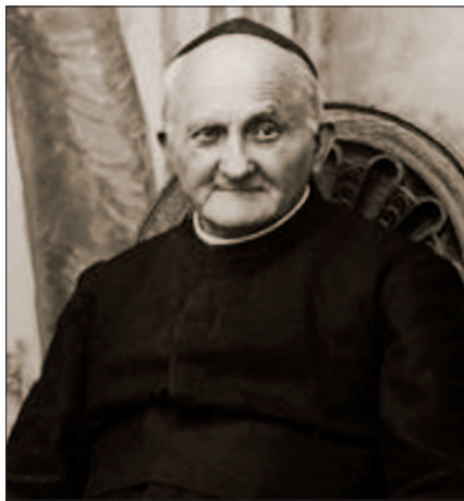
■ Bl Arnold Janssen

has sent me!" In 1456 her sentence was considered to be illegal by the Apostolic See; Pope Leo XIII agreed to prepare her beatification. In 1920 Joan of Arc was canonised.