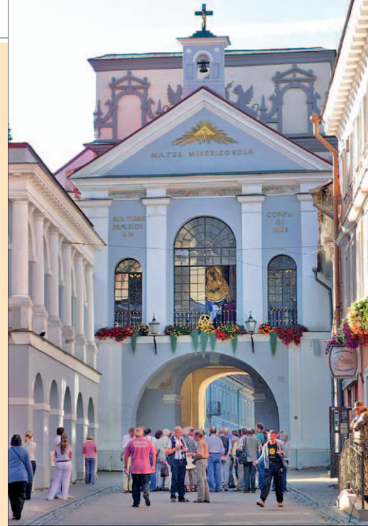
■ Ostra Brama, Vilnius, Lithuania

Pilgrims will have the choice of coming for the full pilgrimage starting and finishing in Warsaw or having their return flight from Vilnius in the four day and six day options.