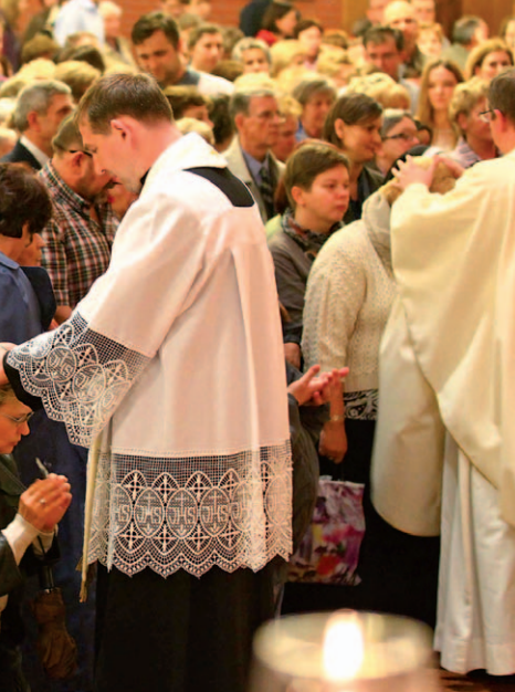
■ Holy Mass during the visitation of the statue of St Michael in Polish parish

were requested to help in constructing a wooden base for the statue of St Michael the Archangel. This was, however, no ordinary statue, but one intended to carry the statue of St Michael the Archangel around Poland and to be blessed at the grotto at Mount Gargano. I asked that St Michael be brought to our joinery workshop. It is hard to describe the joy I felt during this extraordinary meeting. In a moment of silence, gazing at the face of the Archangel, I said to him in my heart: "St Michael, it is wonderful what you are doing for me. I cannot come to you, so you came to me... May God who sends you at this time and place, be praised!"