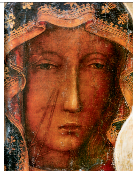
■ Our Black Madonna in Czestochowa, Poland

Single room supplement £140 / €165 / $225