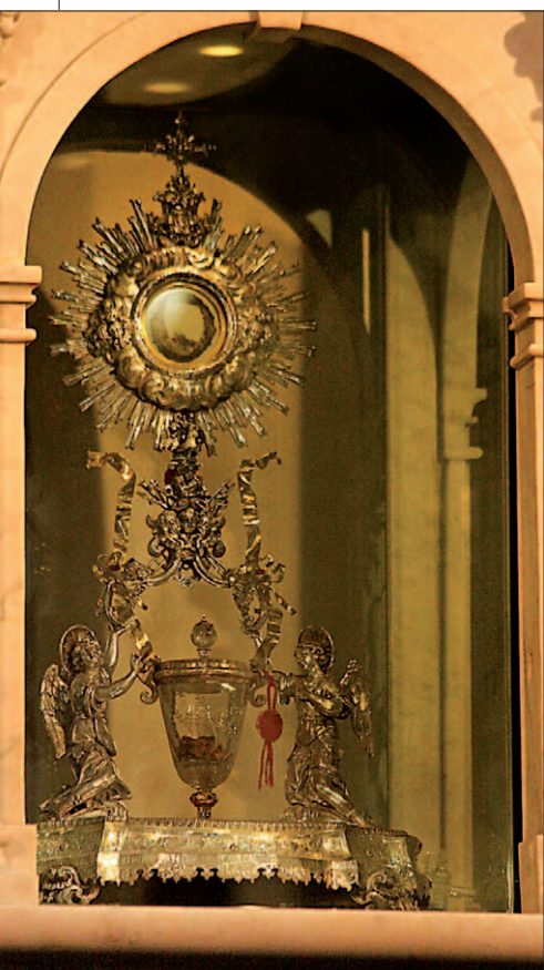
■ The Eucharistic Miracle in Lanciano, Italy

People are afraid of falling back into old Manichean theories, or into frightening deviations of fancy and superstition. Nowadays they prefer to appear strong and unprejudiced to pose as positivists, while at the same time lending faith to many unfounded magical or popular superstitions or, worse still, exposing their souls - their baptised souls, visited so often by the Eucharistic Presence and inhabited by the Holy Spirit! - to licentious sensual experiences and to harmful drugs, as well as to the ideological seductions of fashionable errors. These are cracks through which the Evil One can easily penetrate and change the human mind.