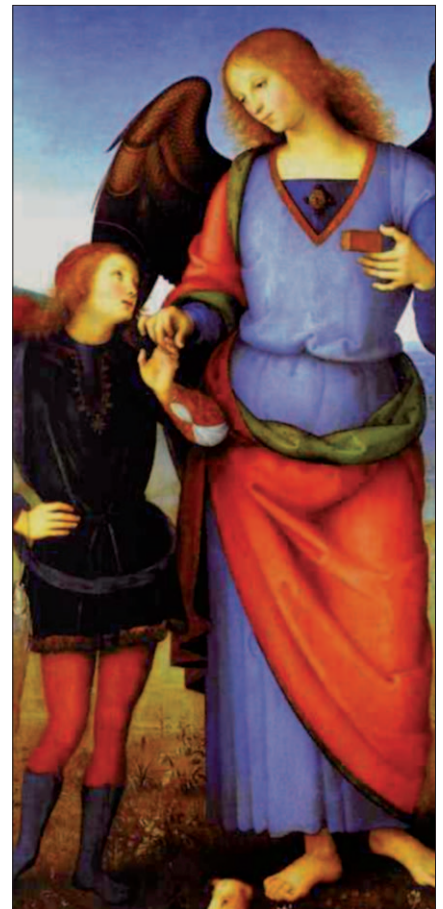
■ Archangel Raphael with Tobias by Pietro Perugino, c. 1496-1500