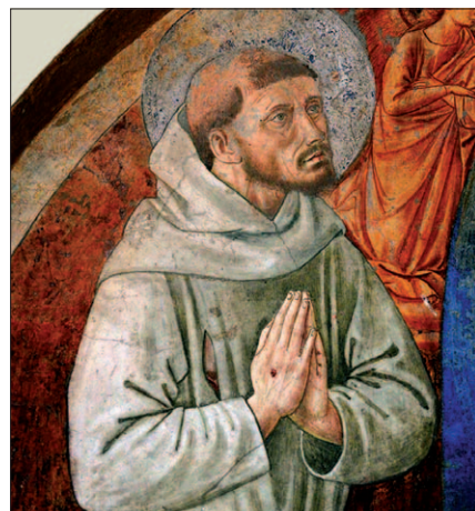
■ St Francis of Assisi by Benozzo Gozzoli, 15th cent.

God's Son. That was the reason why Lucifer persuaded our first parents Adam and Eve to sin.