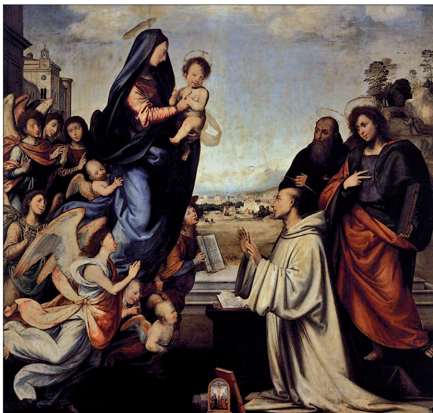
■ The Vision of St Bernard by Fra Bartolommeo, c. 1504

Other blessed spirits are named Virtues because their God-given vocation is to explore and admire with a happy curiosity the hidden and eternal causes of signs and wonders, signs that they display throughout the earth whenever they please by the powerful manipulation of the elements. As