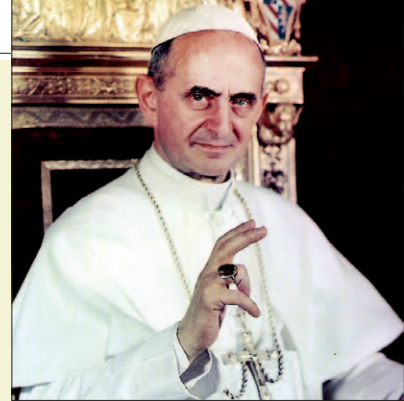
■ Pope Paul VI

The original 40 Statutes were difficult for a good number of ordinary laypeople with work, family and other commitments; However they very much wanted to become a Knight. Many people were already doing 80% of the requirements, such as daily Bible reading, the daily exorcism prayer to St Michael, the daily angelic chaplet to St Michael, fasting each Friday on bread and water or a good deed if a fast is impossible, monthly reconciliation, monthly Eucharist Adoration and once a year the Nine day Novena to St Michael on 29 th Sept. Due to the interest in many people wanting to become Knights of St Michael the Superior General of CSMA in August 2013 decided to make this a devotion, therefore making it possible for every layperson in any country in the world to become a Devotional Knight of St Michael. In the new booklet on The Devotional Knighthood of St Michael published in Feb 2014 people can read all about the knighthood.