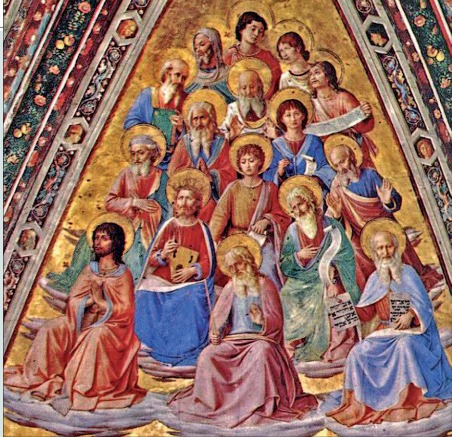
■ Prophets by Fra Angelico, 1447, Chapel of San Brizio, Duomo, Orvieto

The Old Testament proclaims the mercy of the Lord by the use of many terms with related meanings; they are differentiated by their particular content, but it could be said that they all converge from different directions on one single fundamental content, to express its surpassing richness and at the same time to bring it close to man under different aspects. The Old Testament encourages people suffering from misfortune, especially those weighed down by sin - as also the whole of Israel, which had