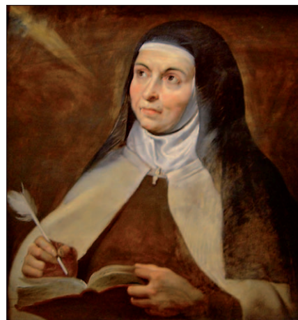
■ St Theresa of Jesus by Peter Paul Rubens, 1615

St Francis de Sales (1567-1622) claimed that the food of angels was to fulfil God's will. Because Lucifer did not want to submit to God, St Michael admonished him with the words "Who is like God!" and pushed him down to hell. Following that, the archangel and the other angels decided to yield to God's will and this made them eternally happy. De Sales supposed that fallen angels felt jealous when they gained knowledge about the salvation of human beings through